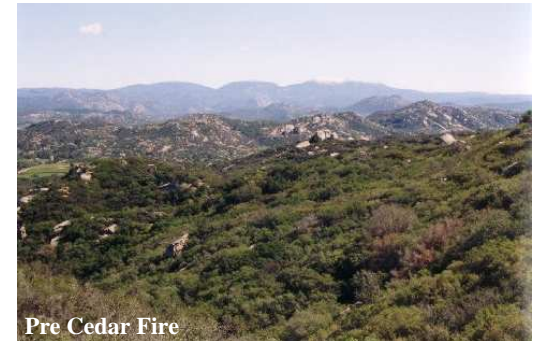
Pre Cedar Fire

Funding provided by a National Fire Plan grant from the Bureau of Land Management through the California Fire Safe Council.