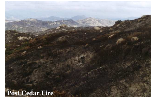
Post Cedar Fire